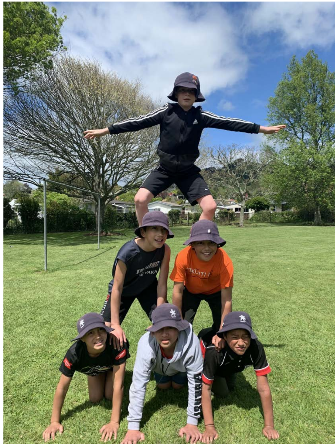
Fun in the Sun, outside enjoying lunch time on Wednesday.